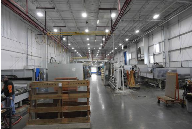
GLASSource installed all new factory lights at their Beechtree Street manufacturing plant.